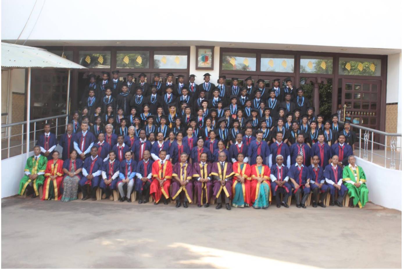
MBBS Graduation Day 2015, the invited Chief Guest with our Chairman, Director- Principal and Faculty